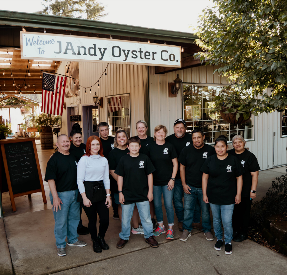
JAndy Oyster Co. | Small Business of the Year Winner