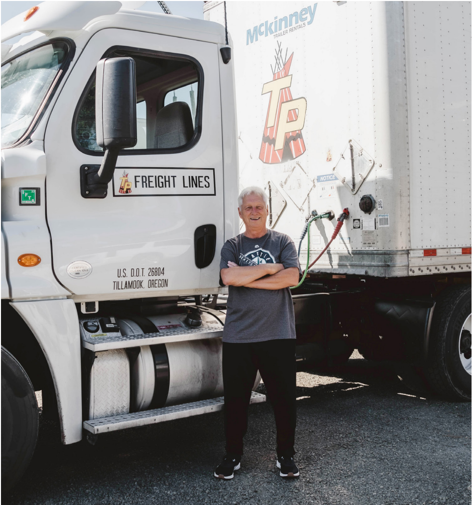
TP Freight Lines Inc. | Business of the Year Winner

Building a strong community where businesses can thrive.