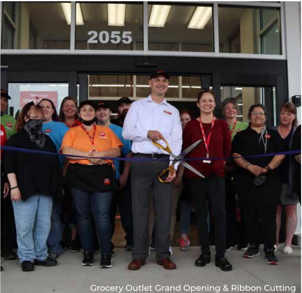
Grocery Outlet Grand Opening & Ribbon Cutting